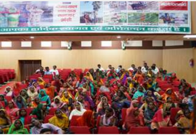
Women gather in large numbers at the Annual Convention

The first Annual Convention of Women Farmer Entrepreneurs was celebrated on 28th September 2022 at the Deen Dayal Upadhyaya Auditorium, Jhansi, where nearly 400 women from all the W4P programme districts of Jhansi, Mahoba and Lalitpur were present. This event aimed at showcasing the programme, the different farm based prototypes put in place and products such as besan (gram flour), dhaliya (porridge), haldi (turmeric), and dhania (coriander) that the women have been able to bring to the market and to local farming community. A booklet showcasing the program and the prototypes was also released at the event.