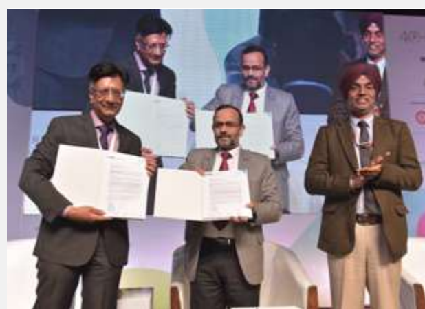
Launching the DA and SBI Foundation collaboration to accelerate entrepreneurship through social innovation