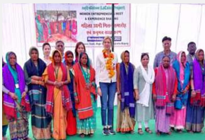
“Ia Caixa” Foundation colleagues meet women members of BASANT FPO and entrepreneurs

The visit ended with the annual workshop of the W4P platform hosted by DA and Alianza-AAA through a series of thematic sessions and round table discussions hosted by the network partners that discussed the key enablers for acceleration of inclusive entrepreneurship, access to credit, role of solidarity collectives, mainstreaming entrepreneurship, and importance of entrepreneurial ecosystem. The ongoing impact assessments of the W4P India programme show evidence of growth and transformation as a result of the application of the social innovation approach and tools to entrepreneurship-led job creation, and highlighted challenges that emerge when initiatives are ready for acceleration and mainstreaming. The workshop concluded by reiterating the importance of the social innovation processes of deep listening and co-creating and the need to work towards systemic changes that foster and accelerate entrepreneurship for women and youth, especially those who belong to disadvantaged groups.