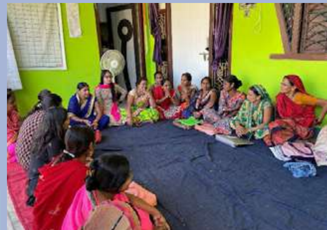
Rang De and DA team unearthing aspirations of women in Bankati, Basti

Innovation in the form of designing credit products suited to the needs of different entrepreneurs can enable aspiring women to take up entrepreneurship. Rang De, one of the core partners of the programme, has co-created three 'persona based' loan products with the community, with customised loan repayment and interest rates. Women entrepreneurs have the agency to choose how much they want to borrow, for how long and at what terms. The platform also enables first-time women borrowers' access to formal credit and helps them build a credit score thereby making financial inclusion possible for aspiring women entrepreneurs. For instance, for women entrepreneurs who aspire to set up technology powered enterprises, such as e-rickshaw, a loan product with seven per cent interest rate per annum has been introduced, with a repayment tenure of 18 months. In the last five years, the customisations has accelerated women entrepreneurship and enabled more than 1500 women to set up micro-enterprises, creating 3200+ jobs.