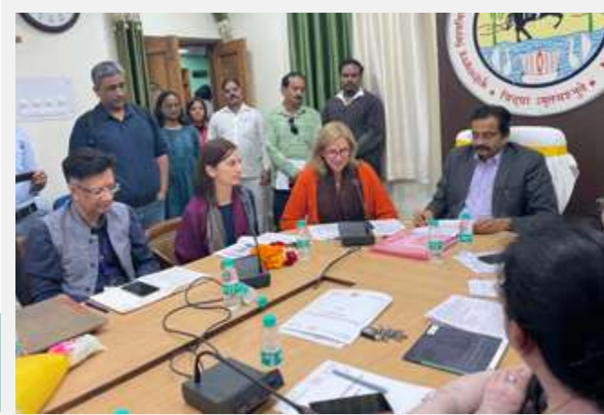
Bundelkhand University hosts the meeting of the District Enterprise Coalition

The visit to AAA’s geography in Bundelkhand was significant as women farmers gathered in large numbers to share their experience of adapting farm-based models in their small landholdings that has brought them better returns, a range of products for sale and a greater sense of solidarity as they became members of the BASANT Farmer Producer Organization. The concern for the environmental impact of chemical fertilizers and pesticides on the soil was evident in the shift being made to natural farming methods. Their presence also signified a shift in their position within the larger social space and the power of collectivization and solidarity.