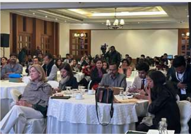
Over 115 participants attended the Annual W4P India Platform Workshop

The visit ended with the annual workshop of the W4P platform hosted by DA and Alianza-AAA through a series of thematic sessions and round table discussions hosted by the network partners that discussed the key enablers for acceleration of inclusive entrepreneurship, access to credit, role of solidarity collectives, mainstreaming entrepreneurship, and importance of entrepreneurial ecosystem. The ongoing impact assessments of the W4P India programme show evidence of growth and transformation as a result of the application of the social innovation approach and tools to entrepreneurship-led job creation, and highlighted challenges that emerge when initiatives are ready for acceleration and mainstreaming. The workshop concluded by reiterating the importance of the social innovation processes of deep listening and co-creating and the need to work towards systemic changes that foster and accelerate entrepreneurship for women and youth, especially those who belong to disadvantaged groups.